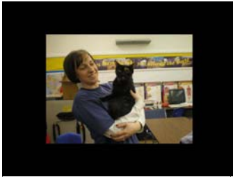
Staff enjoy helping area kitties.